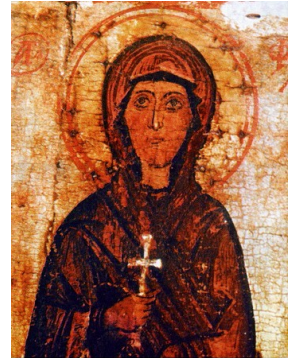
Holy Protomartyr and Equal-to-the-Apostles Thecla of Iconium