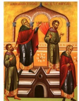
Sunday of the Publican and the Pharisee

10:00 a.m. Divine Liturgy followed by Fellowship Hour