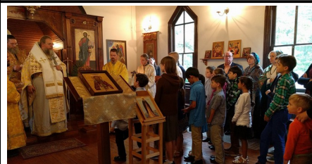
Blessing of the teachers and students for the first day of Sunday School, 2018