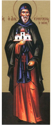
Venerable Euthymius the New of Thessalonica

10:00 a.m. Divine Liturgy followed by Fellowship Hour