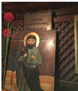
Relics of St. John the Little