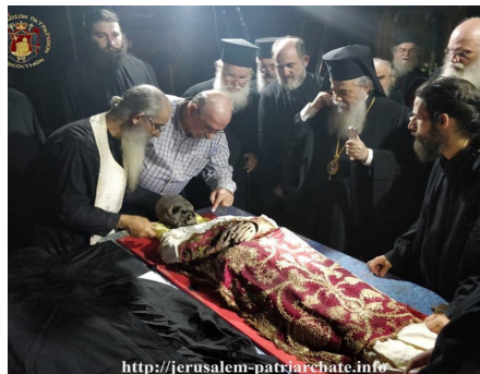
Relics of St. Sabbas