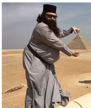
Pyramids of Giza

Grumbling is caused by misery and it can be put aside by doxology (giving praise). Grumbling begets grumbling and doxology begets doxology. when someone doesn't grumble over a problem troubling him, but rather praises God, then the devil gets frustrated and goes off to someone else who grumbles, in order to cause everything to go even worse for him. You see, the more one grumbles, the more one falls into ruin.