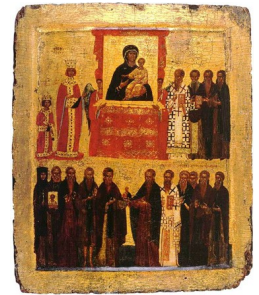
Triumph of Orthodoxy

10:00 a.m. Divine Liturgy followed by Fellowship Hour