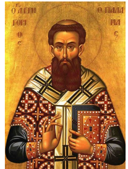
The Sunday of St. Gregory Palamas

10:00 a.m. Divine Liturgy followed by Fellowship Hour