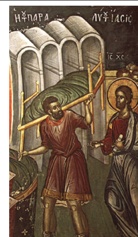
The Paralyzed Man

9:15 a.m. Choir practice 9:30 a.m. Reading of the Hours 10:00 a.m. Divine Liturgy followed by Fellowship Hour