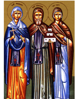
Virgin-martyr Febronia of Nisibis